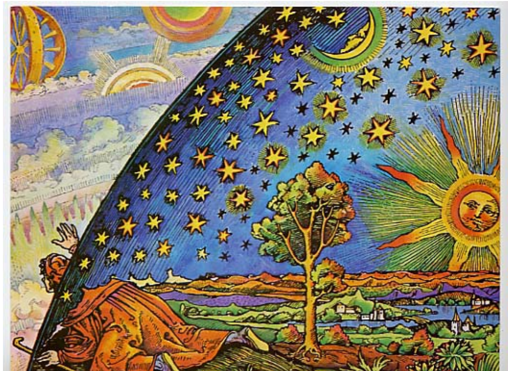
Woodcut by Camille Flammarion c. 1870. Color version copyright © Roberta Weir 1970.

French Astronomer and historian of science Camille Flammarion published this illustration late in the nineteenth century, but it is often mistakenly taken to be a medieval woodcut depicting a flat earth. As best we can tell today, the figure depicted as having traveled to the edge of the universe and poked his head through the firmament to gaze upon the machinery that moves the heavenly bodies is Flammarion's depiction of Archytas' Problem . Archytas was an ancient Greek figure who criticized Aristotle's conception of a finite spherical universe by arguing that the universe could not be finite, because someone could come to the edge and poke his hand or a stick through to the space beyond. Such is the stuff of philosophy.