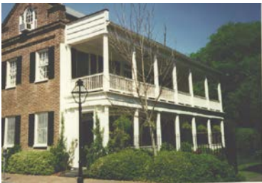
14 Glebe Street

The Department sponsors many activities for Philosophy majors, other students, and faculty at the College. There is a Philosophy Club, which is an excellent organization for getting to know students with common interests outside of class. Each year the Club members and officers plan activities of interest to Philosophy students. The Club sponsors discussions and films of philosophical interest. The Club also sponsors a meeting with faculty to discuss graduate school opportunities and an oyster roast in the spring.