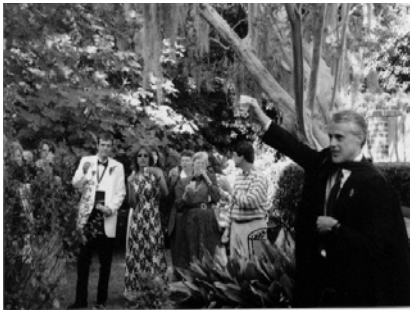
1997/98 Graduation Reception